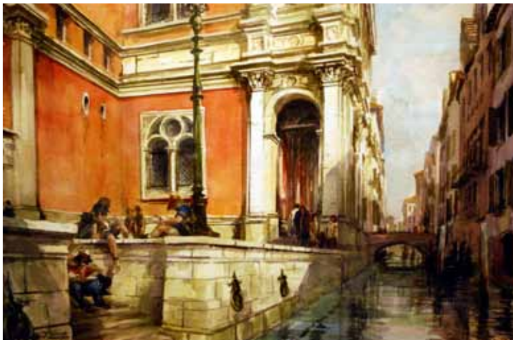
A Moment of Reflection, The Scuola Grande di St. Rocco, Venice BY ANTHONY J. BATTEN