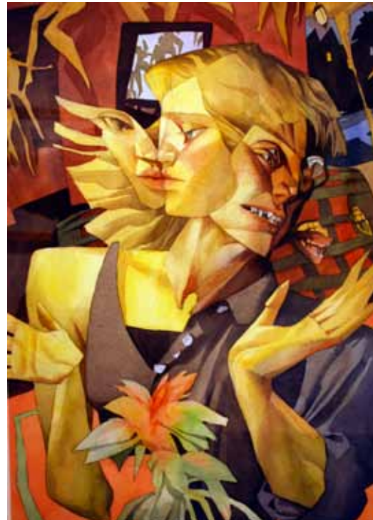
Open House BY RUDOLF STUSSI