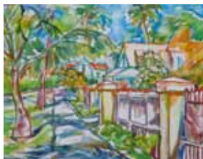
SHADY LANE, PUNTA GORDA

Our favourite summer cruising grounds are in Lake Huron's North Channel. The La Cloche mountain range, so ancient that they are actually hills, are a beautiful backdrop to the countless bays that provide safe, overnight havens for boaters. Baie Fine "fjord", the Benjamin Islands, OSA Lake, and dear old Killarney offer great sketching opportunities. Both the Killarney Provincial Park and Killarney