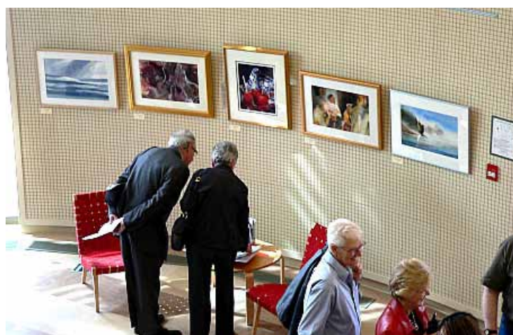
A WELL ATTENDED EVENT - THANK YOU PORT COQUITLAM