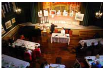
ARTS & LETTERS CLUB

Many thanks to all those who volunteer every year, and help to make this a very enjoyable event. I wish everyone in the country could attend because you meet the nicest people at the AGM!