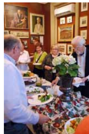
GREAT FOOD AND FANTASTIC ATMOSPHERE