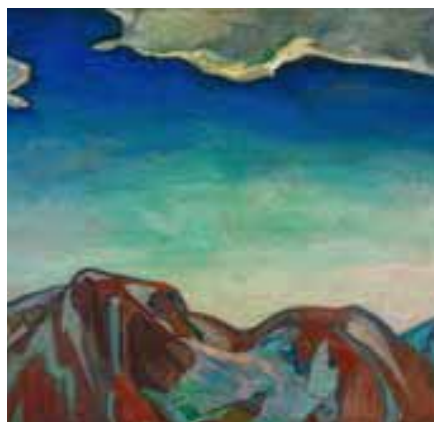
THE CLOUD, RED MOUNTAIN, 1927-28, OIL ON CANVAS, 87X102.2 CM, ART GALLERY OF ONTARIO, TORONTO.

The exhibition is framed between Tom Thompson's classic views of Algonquin park's lakes and trees and Lawren Harris's spare and powerful visions from the Great Lakes to the Arctic. Wherever possible the finished work is presented with the initial sketch, an invitation to watch the creative process in action. The exhibition has as well brought together a significant number of paintings held by individual collectors and