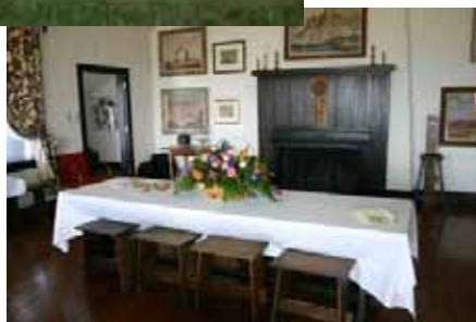
The Gallery "Great Room"

The Leighton Art Centre, Gallery and Museum has become a well-known art venue showcasing a variety of outstanding exhibitions by Alberta Artists. The predominant focus of art, inspired by the landscape, is the legacy the Leighton Art Centre is built upon. The gallery, with 120 running feet of exhibition space, hosts several exhibits throughout the year.