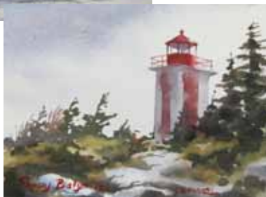
Point Prim by POPPY BALSER

(Editor's Note: I was only looking for a good article about art and marketing when I contacted Poppy but art is sneaky and dangerous, I ended up purchasing 3 of Poppy's daily paintings and it was a struggle to get to the website in time before the daily paintings were sold. Note also that it is relatively easy to set up a Pay Pal ordering process on a blog or website, which is an essential component of this project.)