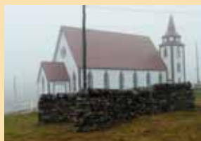
English Harbour Arts Centre

in the former All Saints Anglican Church, a fully restored building that offers workshop and exhibition space with access to splendid outdoor vistas on the Bonavista Peninsula. Please visit www.englishharbourartscentre.com for more information and an application form.