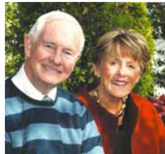
Their Excellencies the Right Honourable David Johnston, Governor General of Canada and Mrs. Sharon Johnston.

The CSPWC has been honoured by the Patronage of the new Governor General of Canada. Sworn in on October 1, 2010, His Excellency the Right Honourable David Johnston is the 28 th governor general since Confederation. This has been a long tradition of the Society and we have to reapply every time there is a change of Governor General.