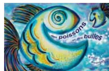
EDITH BOURGET ILLUSTRATES CHILDRENS BOOKS

watercolours: Des poissons et des bulles and Le royaume de Nedji .