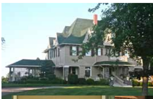
The Hillcrest, St. Andrews