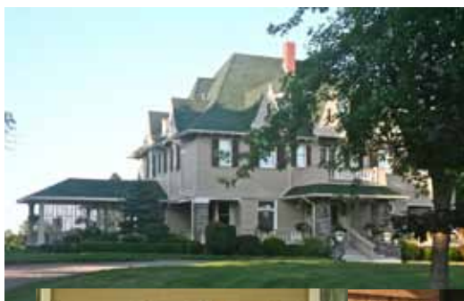
The Hillcrest, St. Andrews