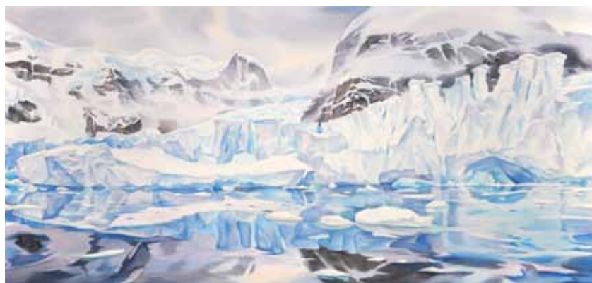
CURRY'S - DA VINCI WATERCOLOUR AWARD ($500 PRODUCT) David McEown CSPWC (Vancouver, BC) Paradise Bay, Antarctica David had to leave to teach before the award presentations but he left a message. "Witnessing climate change among the massive ice shelves and glaciers, I contemplate this melting flow of water that affects us all. Watercolour is an ideal medium for attempting to capture the light and flow of this journey..."